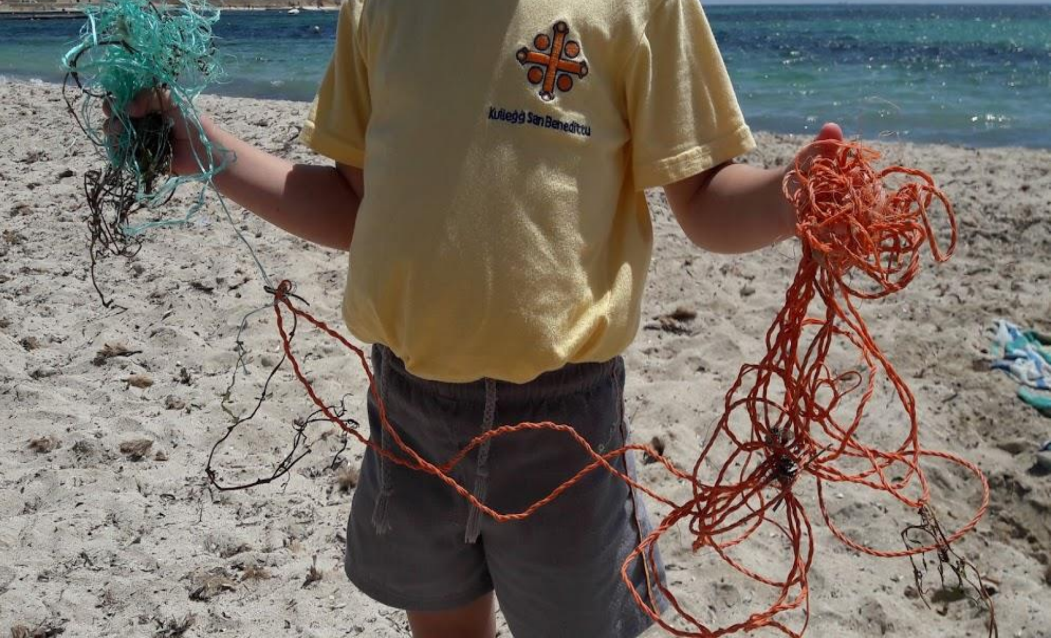
Fishing ropes – picked during a beach clean-up by students