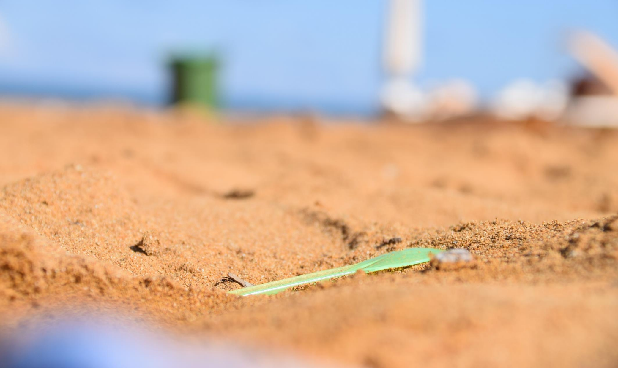
Ice-cream spoon - littering a sandy beach, Ramla l-Hamra, Gozo