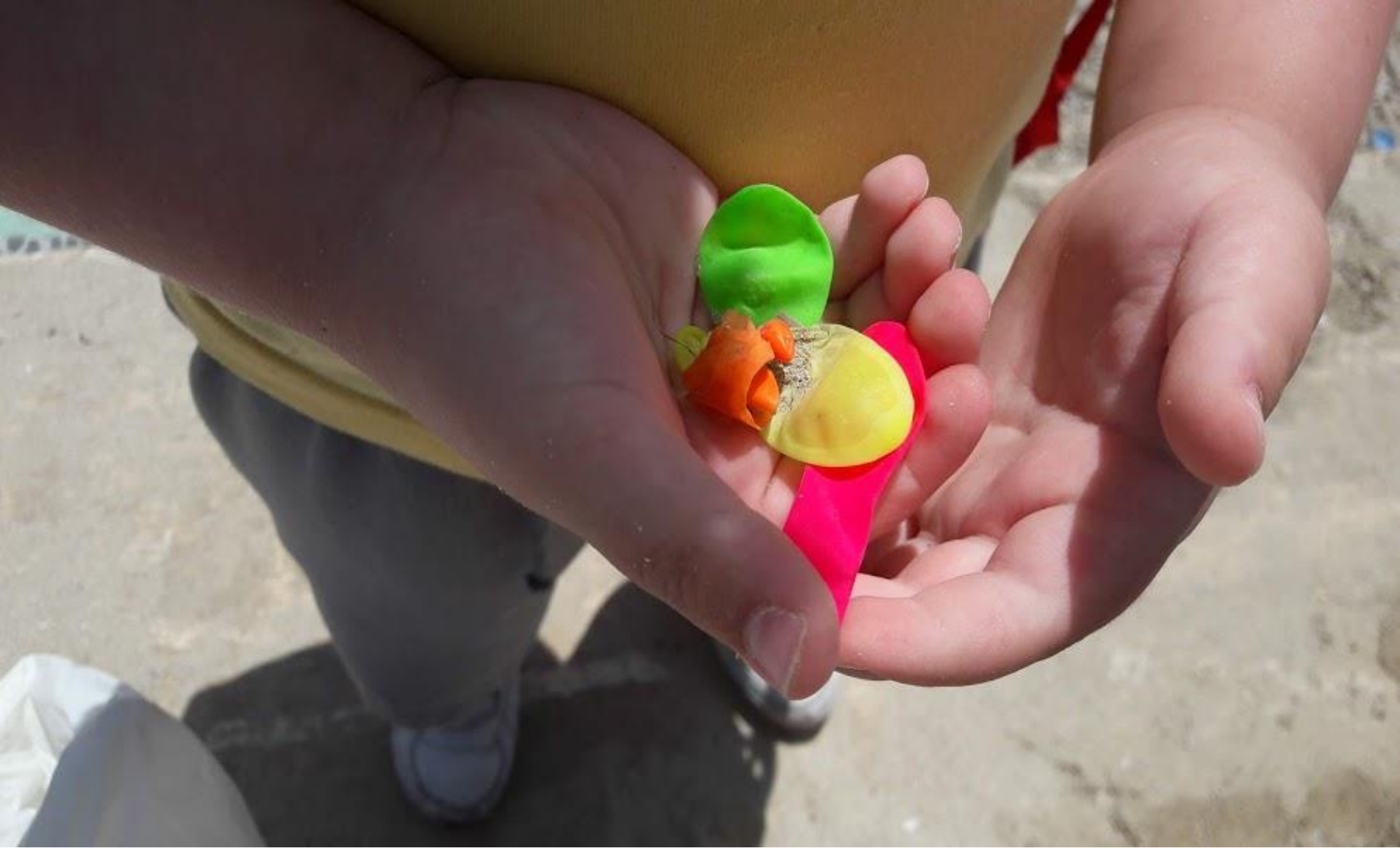
Water balloons – picked during a beach clean-up by students