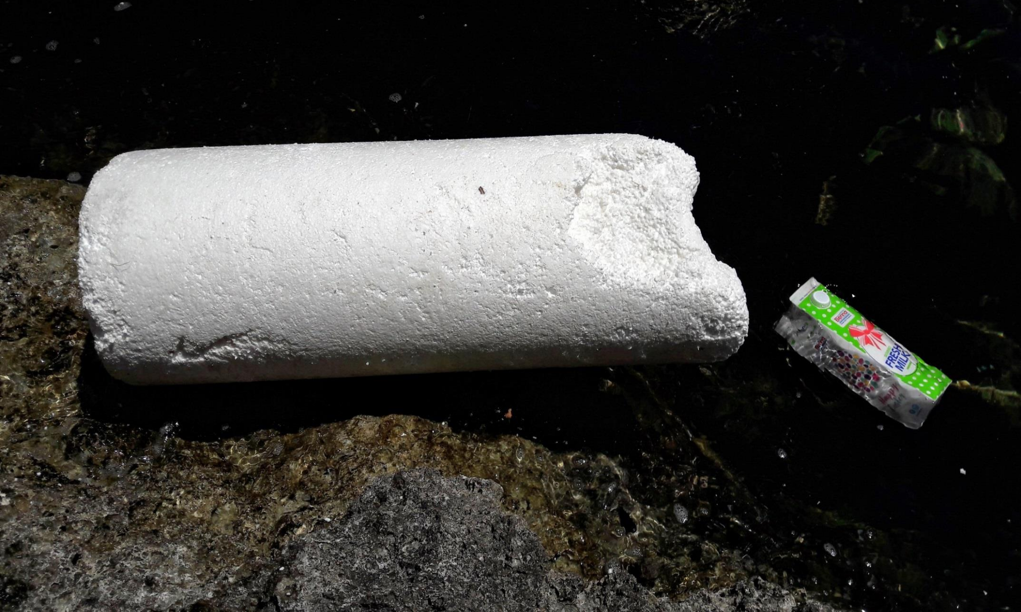
Jablo / polystyrene - washed ashore