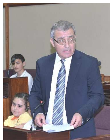
Hon. Evarist Bartolo, Minister for Education and Employment

The event has once again proved to be a huge success, widely reported in the local media and streamed live. The EkoSkola Steering Committee would like to thank all those who made this experience possible – particularly the Hon. Mr Speaker, Dr Anġlu Farrugia and his Office for granting us permission to use the premises.