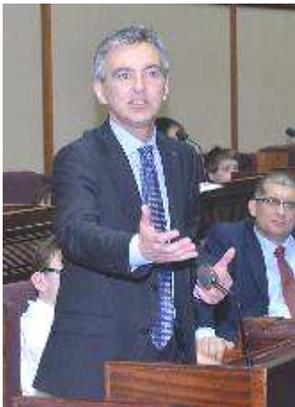
Hon Dr Simon Busuttil, Leader of the Opposition