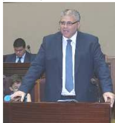
Hon. Anton Refalo, Minister for Gozo

The Hon. Anton Refalo, Minister for Gozo, said that he felt honoured that he was sharing this session with such a committed group. He said that this was the best parliament session that he has ever experienced since 1987. Reflecting on the students' summit declaration, he acknowledged that "sustainable development is a theme that you regularly discuss – well done for finding a balance between economic, social and environmental concerns ... this is particularly important for Gozo" .