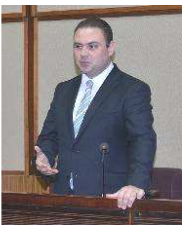
Hon. Owen Bonnici, Minister responsible for Justice, Culture and Local Government

Four members of parliament then replied to the issues raised in the declaration.