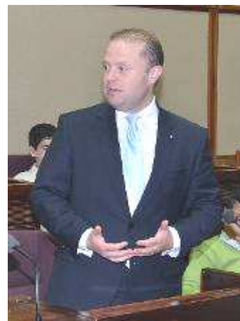
Hon. Dr Joseph Muscat, Prime Minister