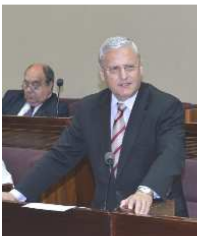
Hon. Leo Brincat, Minister for the Environment, Sustainable Development & Climate Change

attention and that adults need to learn from them. He pointed out that they have access to families. "You are change agents and education is the tool that will change our mentality" .