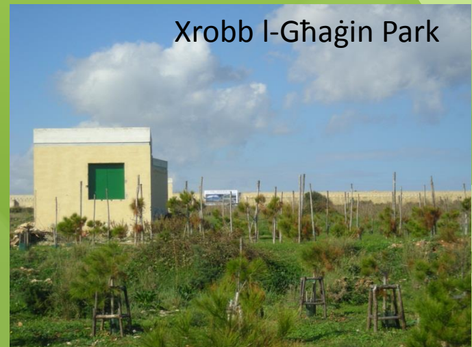
Xrobb l-Għagin Park