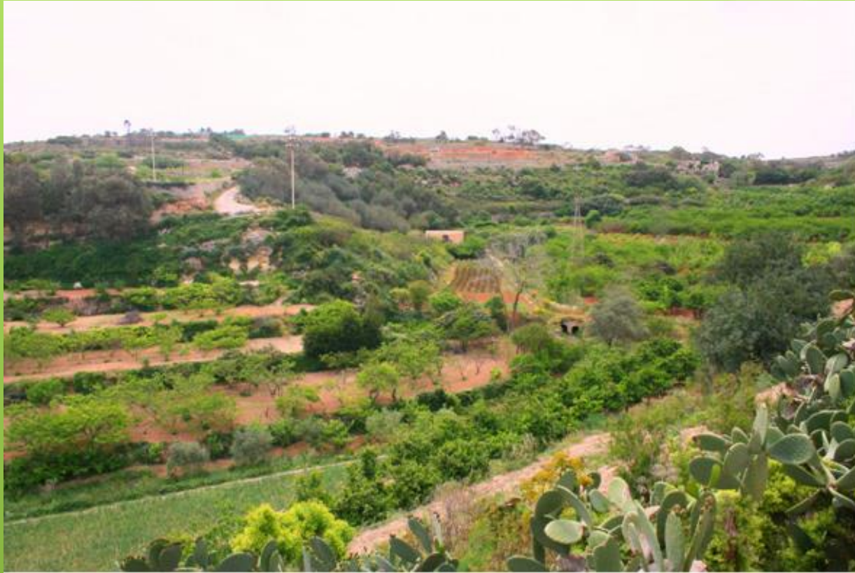
Wied Hażrun, Dingli