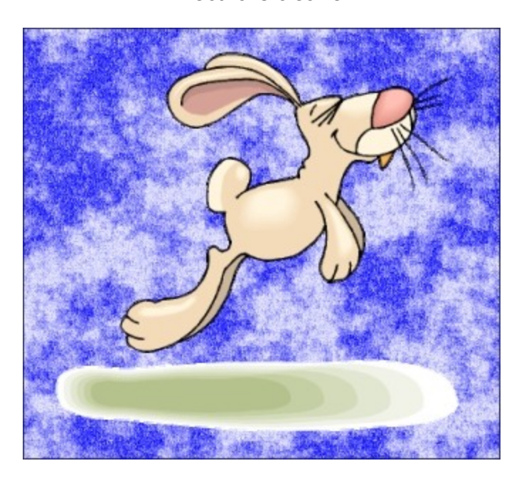
and fits my demeanour. But it's range isn't far, not as far as a car.