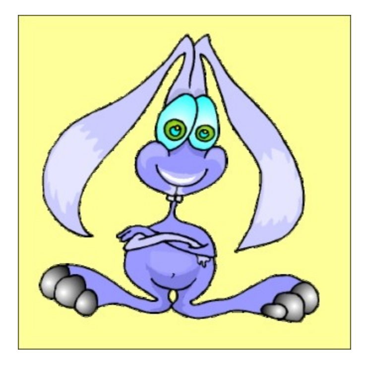
like a wise little bunny.