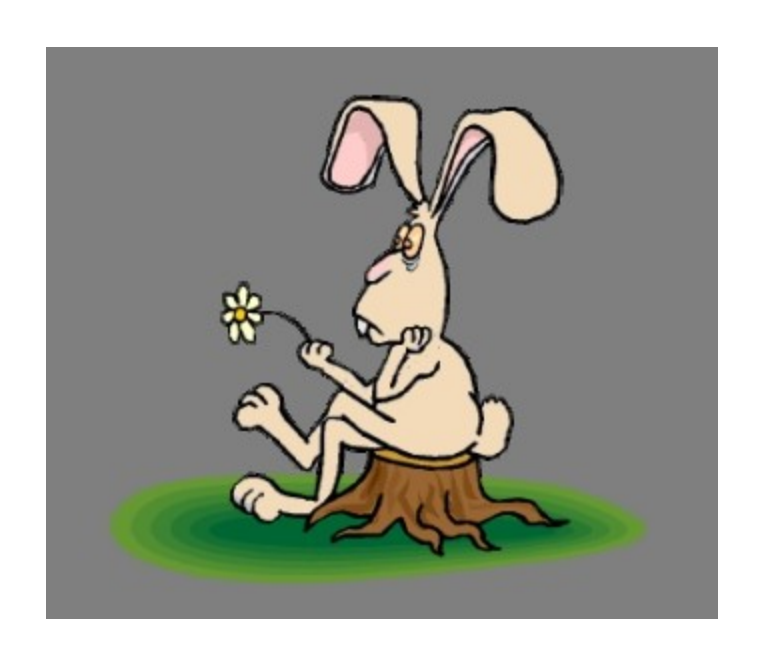
but which should I use? It's so hard to choose.