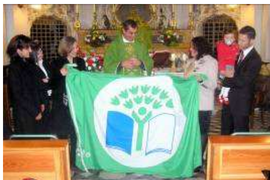
Left: The EkoSkola teachers presenting the Green Flag during the thanksgiving mass.