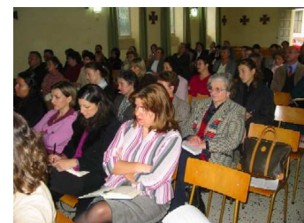
Head teachers and teachers participating in the Seminar