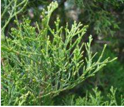
Sigra ta' l-Gharghar (Sandarac Tree)

Hdejja hemm hafna sigar oħrajn, pjanti u fjuri sbieħ. L-ghaxqa tagħna hi meta tfeġġ ix-xemx, ghax għandna bżonnha, għalkemm fis-sajf taħraqna. Ir-riħ idejjaqni u jweġġaghli rasi u r-ragħad ibeżżaghni. L-ikbar ħabiba tiegħi hi l-Balluta, u vera ħabiba ghax sigriet taf iżzommu. Għandi ħbieb oħrajn bħall-farfett l-aħmar, in-nannakola, il-qanfud u l-ghasfur il-griż. Niddejjaq hafna meta jiġu xi tfal imqarbin jiddendlu miegħi u jqaċċtuli l-weraq u jweġġghuni. Tgħidx kemm nibki.