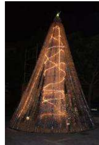
Our plastic Christmas Tree in the morning (left) and all lit up at night (right)