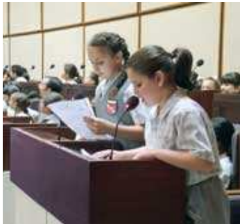
Children making their presentation