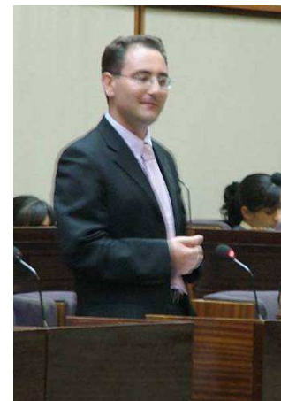
Opposition spokesperson for the Environment, Hon. Roderick Galdes

The Hon. George Pullicino, Minister for Rural Affairs and the Environment, heartily thanked the children participating in EkoSkola for their commitment. He recalled the emotional moment when he saw the look of satisfaction on the children’s faces during the official Green Flag hoisting ceremonies. He considers the Green Flag an invitation for environmental