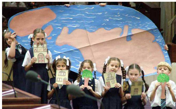
Malta's future ... our future

So we would like you to support our efforts for a better Malta by giving us your word that you will keep the present and future welfare of our environment in mind in every decision taken in this House. This will ensure that we will have a good quality environment that we can enjoy and live safely in.