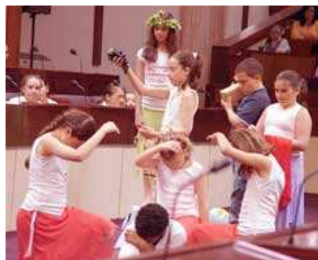
One of the performances staged by the children for the parliamentary session

After the last intervention, the Hon. Deputy Speaker moved for the approval of the motion. The motion was unanimously approved by the parliament and the session was closed with the singing of the song by the choir of the Primary School C - Mqabba.