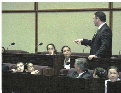
The Hon. Owen Bonnici, Opposition spokesperson for Youth and Culture

the Coastal and Marine Environment . The Hon. Owen Bonnici (Opposition spokesperson for Youth and Culture) told children that when he was their age, the world community was meeting for the Rio Summit that maintained that the creativity of children and youths is the solution of our environmental problems. At that time there was no EkoSkola, but nowadays you that now you have the chance to do something worthwhile. Past generations had their fights, for example for independence and for freedom; we are now being called by our country to take up the environmental revolution.