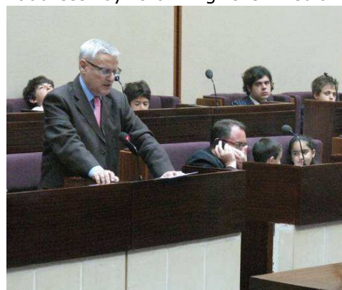
The Hon Leo Brincat, Opposition spokesperson for the Environment, Sustainable Development & Climate Change

After students from St Clare College, Gzira Boys' Secondary discussed Environmental Health , the Hon Leo Brincat (Opposition spokesperson for the Environment, Sustainable Development & Climate Change) started his address. He voiced his appreciation at the suggestions being tabled by the children. During his address he pointed out that Climate Change was becoming a threat to our water quality and quantity that will generate more energy needs. He said that "we should