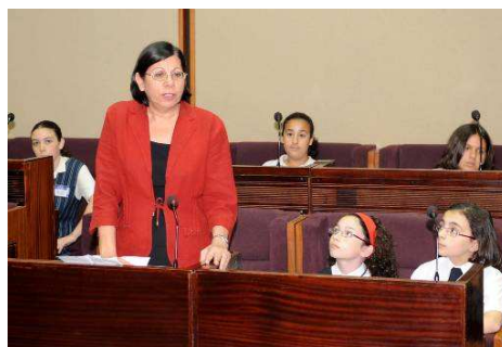
The Hon. Dolores Cristina, Minister of Education, Culture, Youth & Sports

Students from the Gozo College, Ghajnsielem Primary and St Ġorġ Preca College, Paola Primary A expressed their concerns about Climate Change and Land respectively. The Hon. Dolores Cristina (Minister of Education, Culture, Youth and Sports) referred to the motion presented by the children. She pointed out that the fact that suggestions made by the children were taken up and integrated in policies is a sign that MPs are giving due importance to what children say.