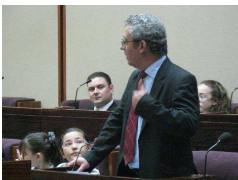
The Hon. Evarist Bartolo, Opposition spokesperson for Education and Media

Students from St Benedict College, Safi Primary started the students' reply by reviewing the SOER Chapter on Driving Forces for Environmental Change . They were followed by the presentation by the students from the Gozo College, Nadur Primary about Air . Hon. Evarist Bartolo (Opposition spokesperson for Education and Media) then replied by pointing out that he is a great supporter of EkoSkola because the programme is doing a lot of benefit to all our communities and it "provides a model of how an educational process should be" . He pointed out that environmental problems are caused by personal selfishness. He suggested that we should